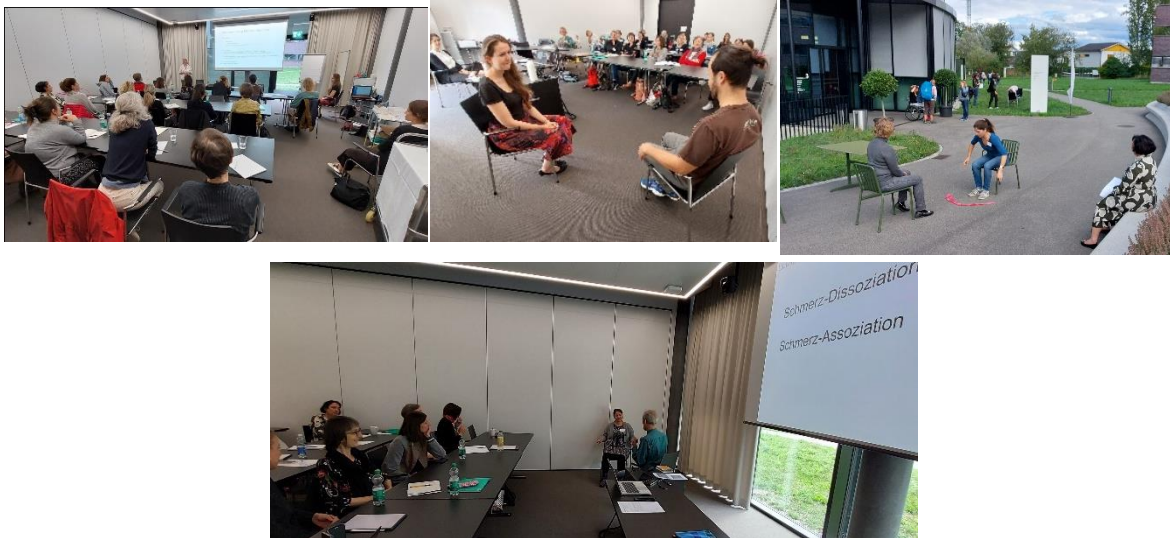
Some impressions of the first 2-day course Pain Psychology

The course was overbooked, the feedbacks very positive and a waitlist for the next course (planned for September 2023) exists.