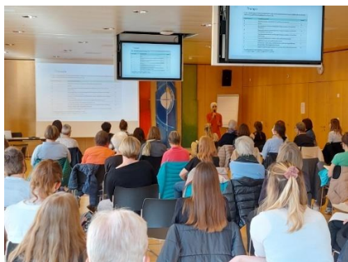
Rheumaliga- Talk Zurich