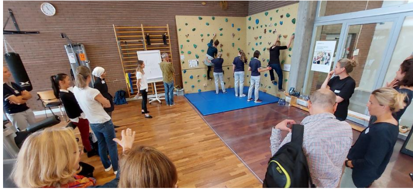
Hands and foot on workshop: Bouldering for chronic pain patients.