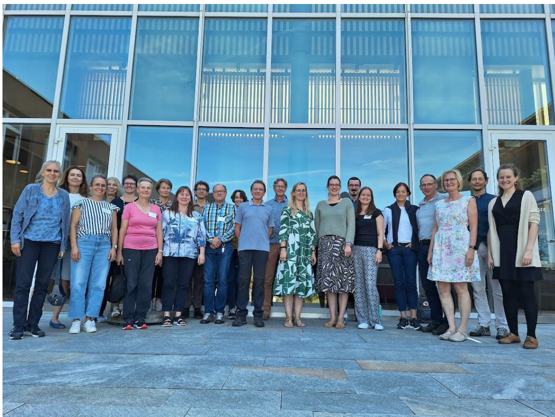
Attendees of the 2. pain psychotherapy course in Nottwil, 2. sept. 2023

The course was once again fully booked, the feedbacks very positive and a waitlist for the next course (planned for 6 th and 7 th September 2024) exists already.