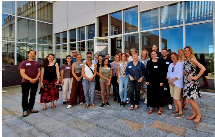
Participants of the 2-days course 6th and 7th of September 2024 in Nottwil

The course was once again fully booked and the feedbacks very positive.